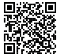
QR CODE FOR VACCINE FACTSHEETS